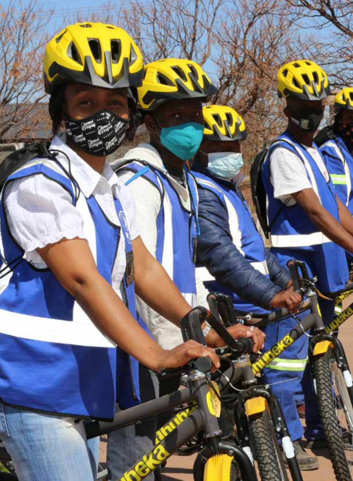
Pictured left: South Africa, Kumba Iron Ore, Kolomela. Community CPF volunteers ready for bicycle patrols on their new bikes.