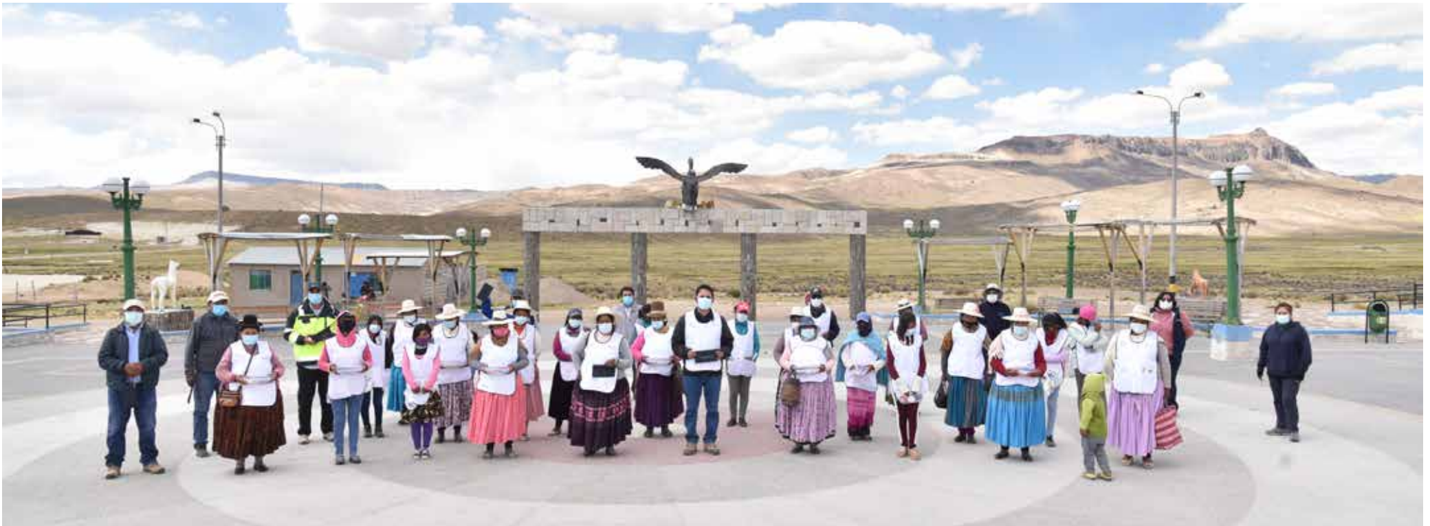
Pictured: Peru, Copper Quellaveco. Community Impact, Aruntaya community. Community clothing production (left), Productive ventures (above) Emprendimientos productivos Aruntaya.

Our Embajadores Programme empowers employees to become active volunteers in their communities by raising awareness and enabling them to use their skills and abilities to help others. The programme offers the chance to work with not-for-profit organisations on projects that meet the needs of the communities around them. Employees can participate as volunteers, devoting their time and talent to serving their communities. The success of the Embajadores programme is what inspired the design of Ambassadors for Good. From 2022 our Embajadores programme will become part of our global Ambassadors for Good programme.