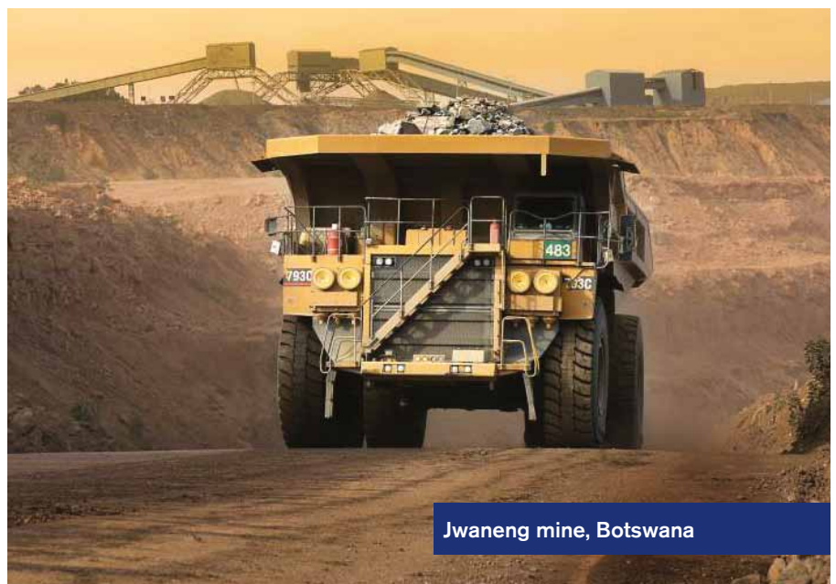
Jwaneng mine, Botswana