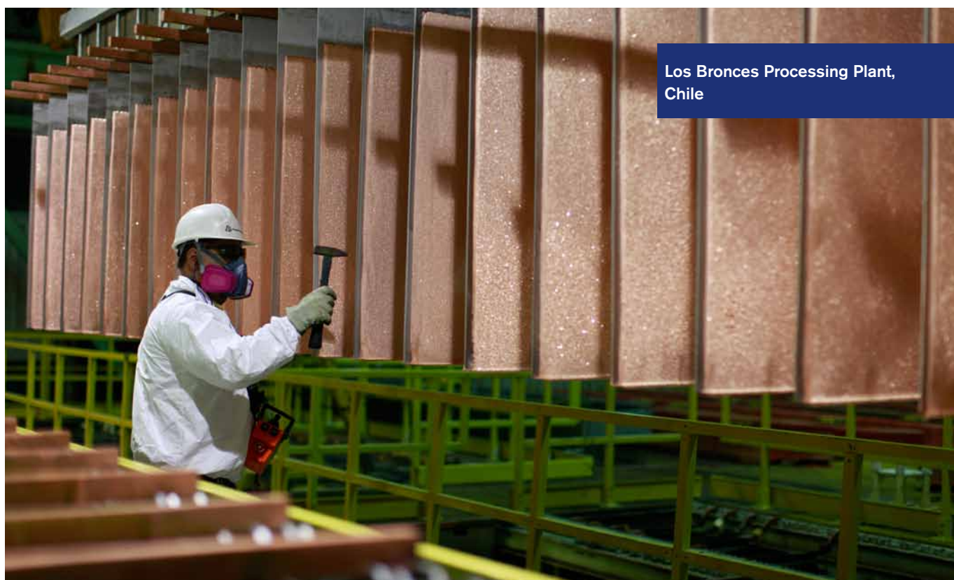
Los Bronces Processing Plant, Chile