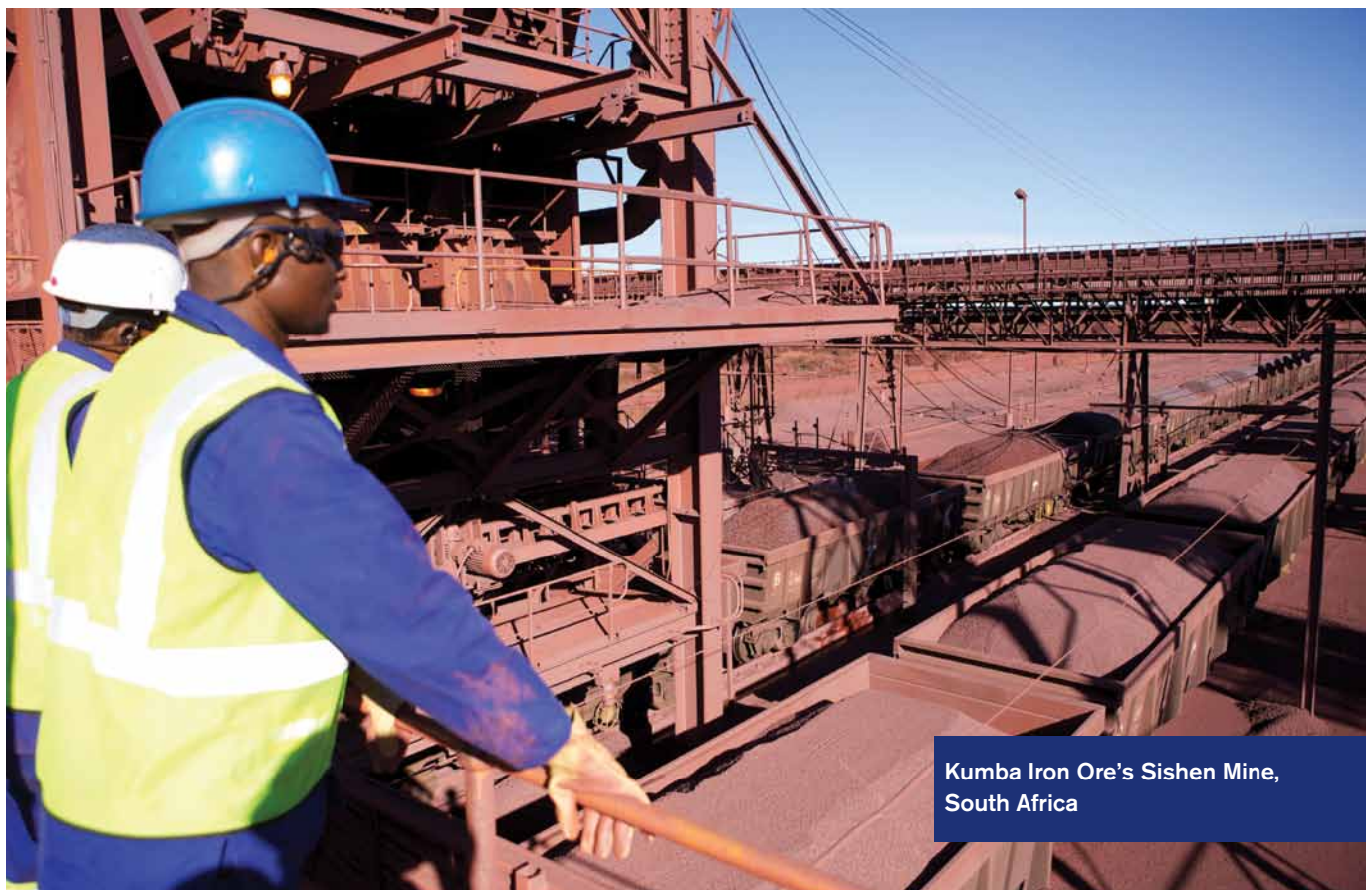
Kumba Iron Ore's Sishen Mine, South Africa