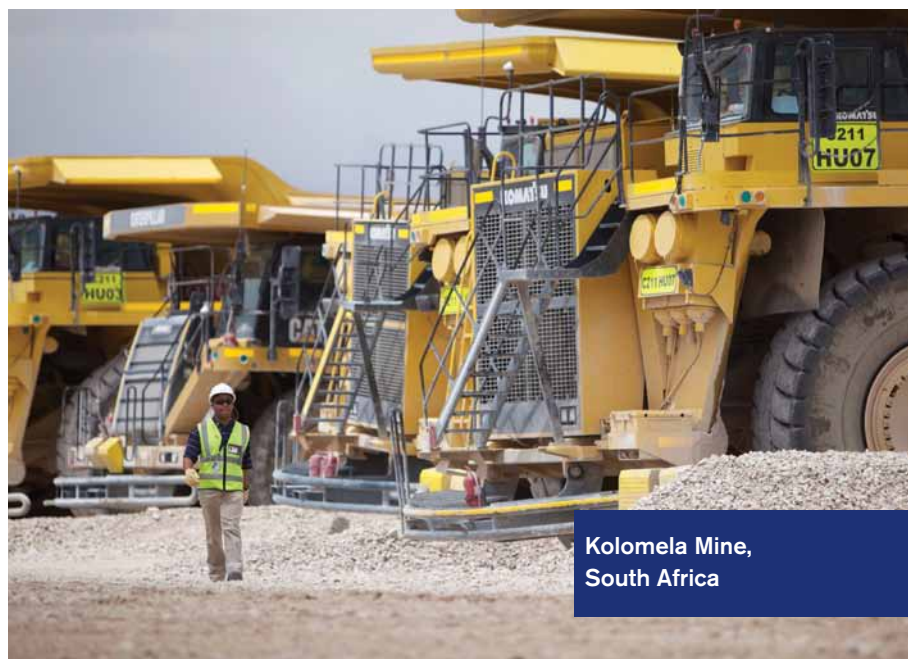
Kolomela Mine, South Africa