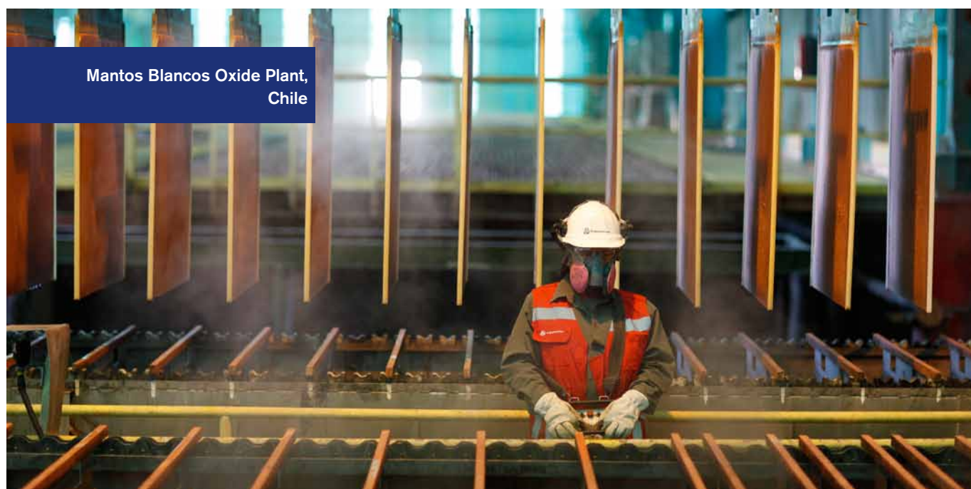
Mantos Blancos Oxide Plant, Chile