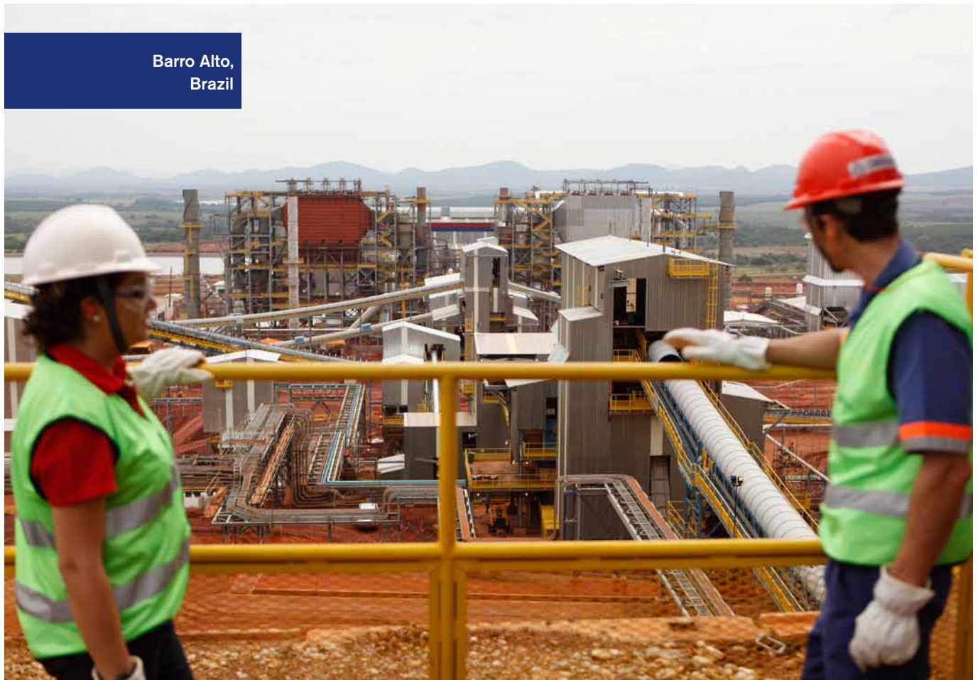
Barro Alto, Brazil