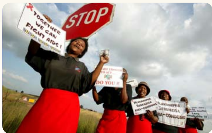
Stop AIDS Now! Peer educators from Goedehoop Colliery handing out condoms on the road

Community programmes are designed to build capacity for comprehensive HIV and AIDS services, in partnership with donors, local and national government, civil society, trade unions, other businesses and public and private health service providers. Focus areas include: access to HIV testing and treatment; HIV prevention activities, with particular emphasis on adolescent sexuality education; improving sexual and reproductive rights and health for women and girls; and socio-economic development of women living in disadvantaged communities.